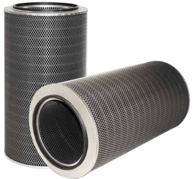
Ultra-Web Conductive FR Cartridge