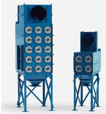
Downflo® Evolution Cartridge Dust Collectors