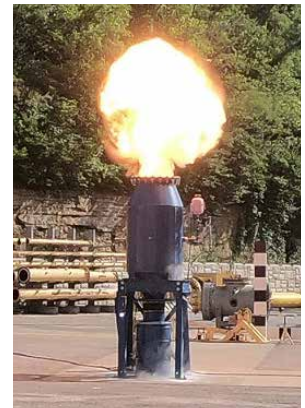
Full-scale testing of the Sealed Drum Kit.

Full-scale testing of the SDK showed it contains flames or sparks from the connection between a properly vented dust collector hopper and the attached drum. When applied in conjunction with effective dust collector explosion protection strategies, including explosion venting or suppression, the Donaldson Torit SDK may be an option for your combustible dust strategy. Consult appropriate standards and experts for further details and considerations.