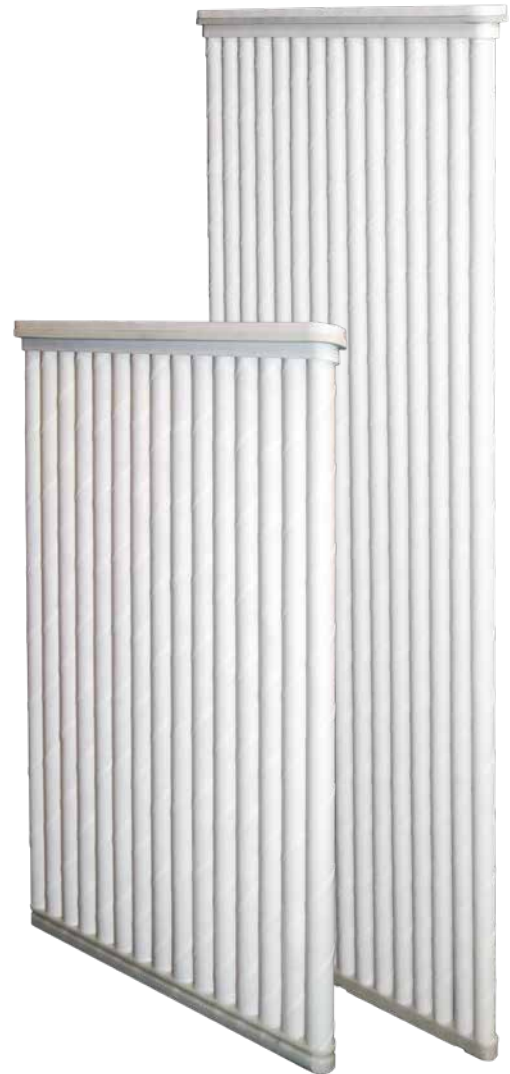
HELIX TUBE RACK