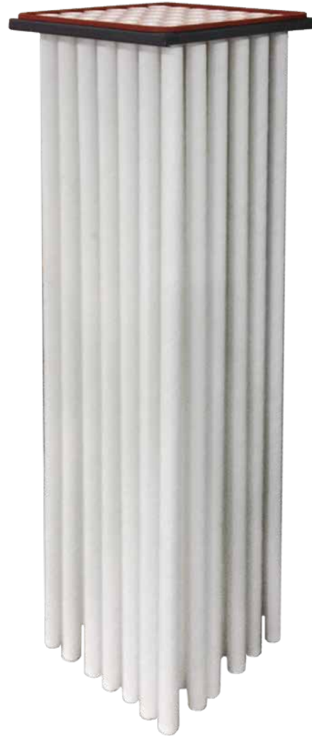
HELIX TUBE cassette