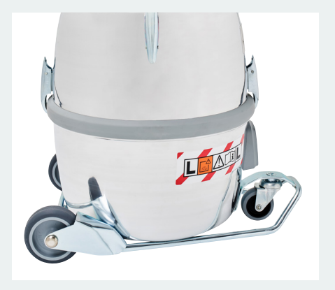
Large rubber wheels

Specifications and details are subject to change without prior notice.