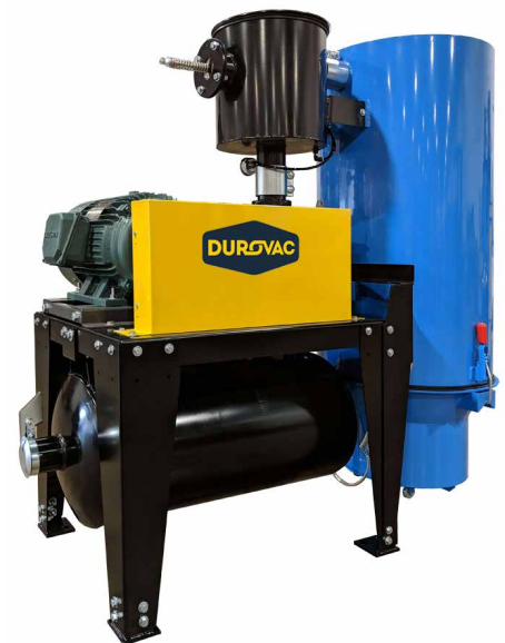
The Portable DVP industrial vac makes a great compact central system.

When you need serious power, you need a positive displacement vacuum producer. That's because it actually pulls harder as the job gets tougher.