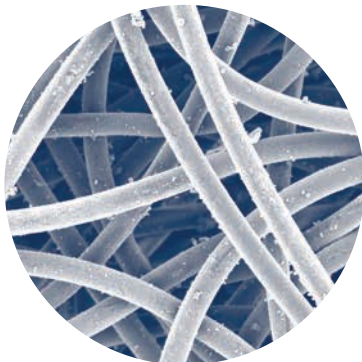
Dura-Life™ Bag-Clean Air Side (300x)

Available as replacement for many popular brands of baghouse collectors.