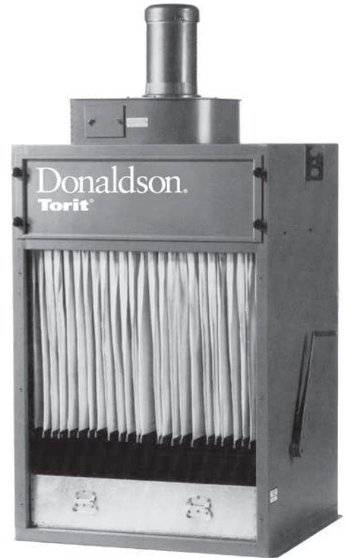
Cabinet 90 (door not shown)