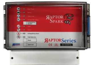
Raptor Spark™ Spark Detector (Infrared Sensor)