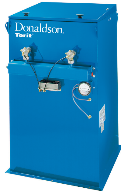
TBV-4 with Plenum

Designed for easy filter service and maintenance—no tools required.