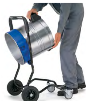
Tilt the container to empty, or simply lift it out of the frame to dispense of its contents.