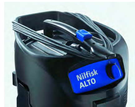
Sturdy grip for easy transport and cable storage.