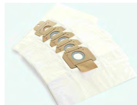
Fleece bags available for easy clean-up of debris.