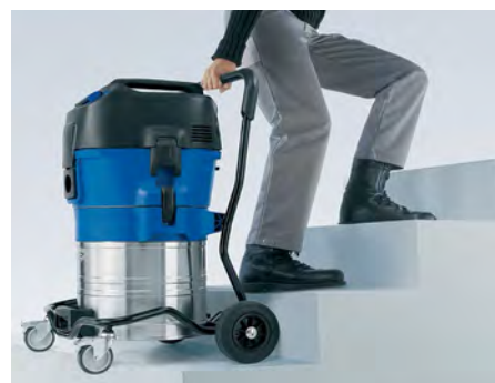
With a comfortable, integrated handle, it's easy to take the Attix 19 wherever the you work.