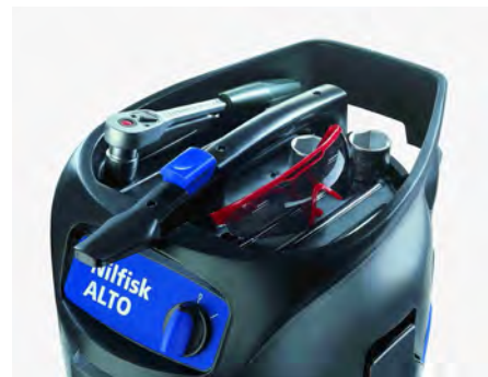
Improved accessory storage and tool deposit.