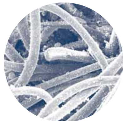
Polyester Bag–Clean Air Side (300x)