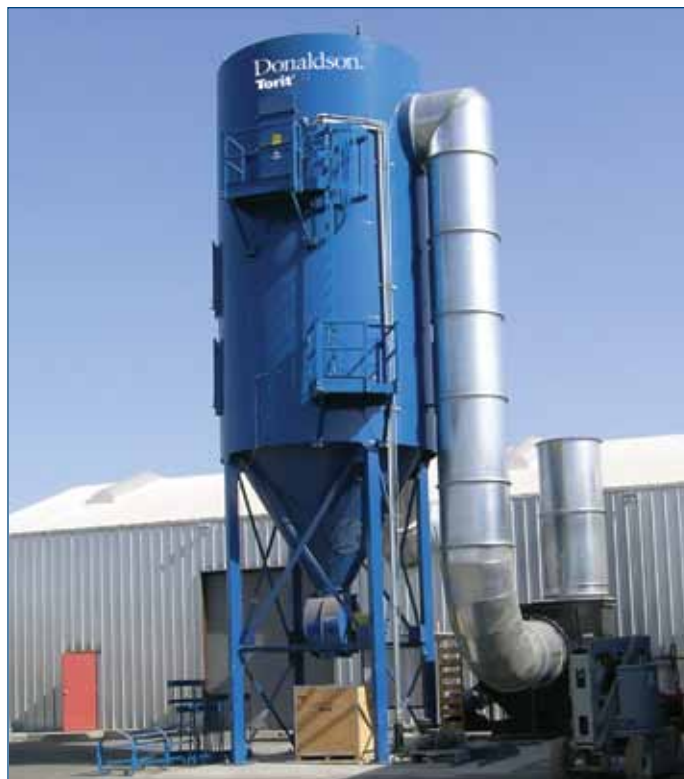
The Dura-Life bag filters in this Donaldson Torit RF Baghouse collector provide longer life and lower emissions at this Midwestern soybean processing plant.

Longer filter life AND lower emissions? Now that's tackling protein dust with muscle.