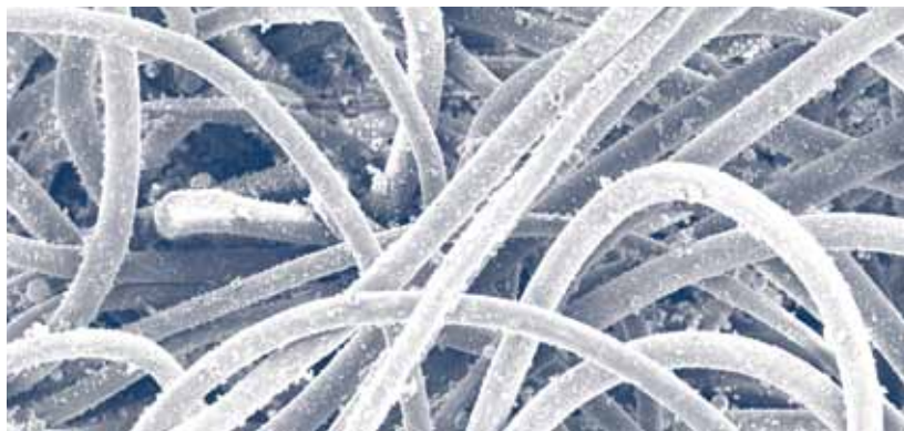
Needed Polyester Bag Clean Air Side (300x)