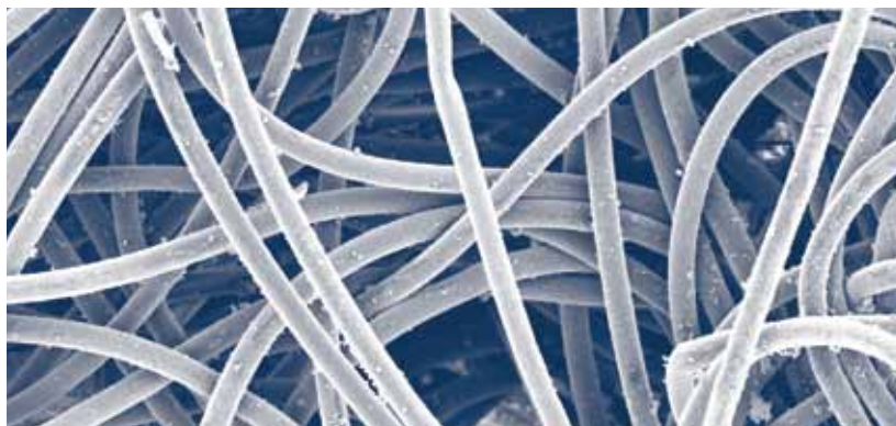
Dura-Life Bag Clean Air Side (300x)

These photos were taken with a scanning electron microscope of bag media used in a collector that was filtering fly ash. The bags were removed after 2,700 hours of use. Air-to-media ratio was 4.5 to 1. Pressure drop after 2700 hours of operation was 6 in. (152.4 mm) on polyester bags and 2 in. (50.8 mm) on Dura-Life.